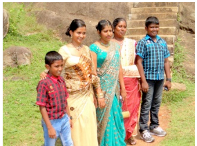
This Sri Lankan family group epitomises so much

It wasn't just the nature alone. The apparent good health of the people was evidenced by a beginning tendency to plumpness. Australia could learn a lot about public health and the emphasis by noting that Sri Lanka labels its relevant department " Health and Nutrition ". Public health is also reflected in the fact that despite the extensive wetlands that we saw, malaria is almost non-existent now although we were told that Dengue fever is on the rise.