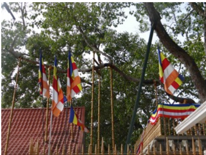
The oldest known living tree, this cutting from the original tree in India under which the Buddha sat to achieve enlightenment

We had a warm interesting encounter with a Buddhist nun. She was sitting in serene meditation. We took her photograph. She asked us to post to her (which we subsequently did). She has invited us to stay with her when we next go to Sri Lanka.