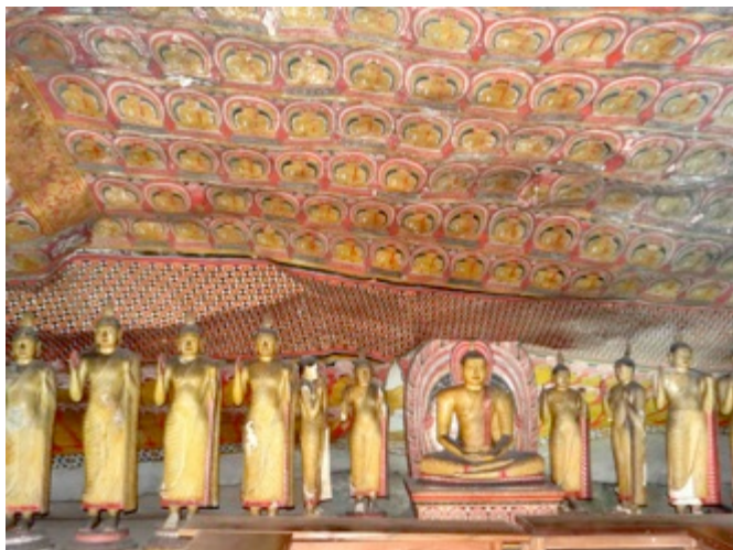
70% Sri Lankans are Buddhists

We both were surprised by our reaction to Sri Lanka. This truncated visit had revealed to us a country and a culture so different to our preconception of it.