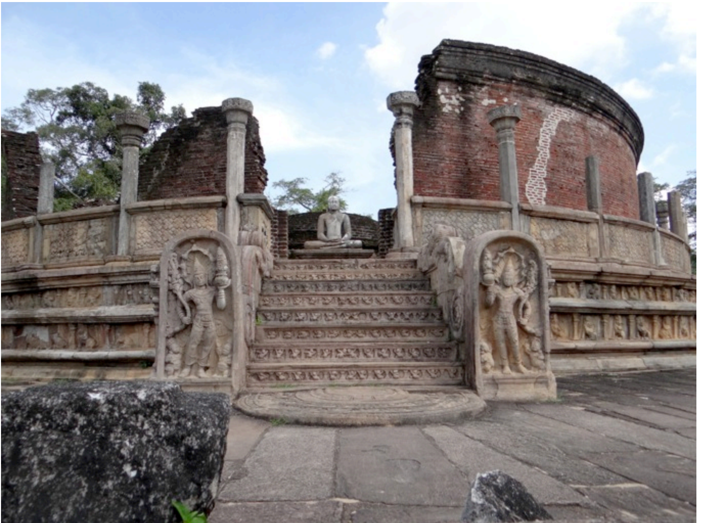
One of the many cultural heritage relics of Polonnaruwa

We went to Sri Lanka to gain a better, more personal understanding of the people and cultures of this troubled country and to discover some of its World Heritage. We visited six sites all north and east of Colombo in the week we had there. We would liked to have seen more and left with a feeling that we would like to return soon.