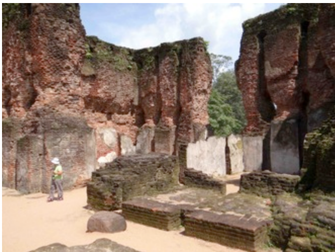
Remnant of Polonnaruva Royal Palace

We next drove across the wall of the largest area of water in all of Sri Lanka, a great reservoir built over 1500 years ago as part of an irrigation system that fed the population in and around this Royal capital at least for 250 years between about 950 AD and 1200.